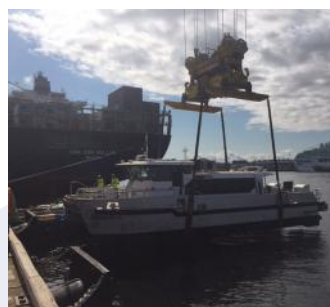
Above Images: Top: Heavy/Electrical Lifts | Bottom: Leisure and commercial boats lifts