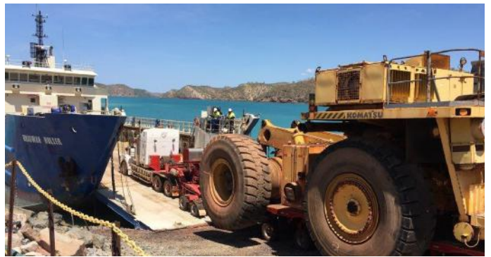
Above Images: International & Coastal transfers bulk/bagged/machinery - Barge